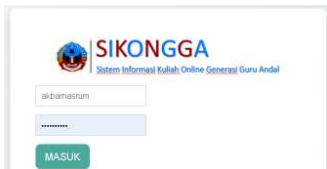
Figure 1. SIKONGGA Login Page

As planned, the Faculty website was finally created. From the website, a subdomain was created with the name https://sikongga.fkipusn.ac.id . It is on this subdomain that the Moodle LMS is installed. The display on the login page can be seen in Figure 1.