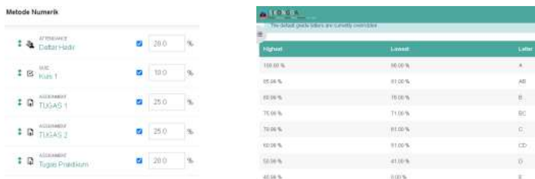
a. Arrangement of assessed aspects

The assessment feature in Moodle works very well. The categories to be assessed can be determined by yourself including the presentation grade. Not only that, the setting of letter grades can also be set in the moodle assessment. Moodle provides letter grading but lecturers can change the grading system according to what is applicable on campus.