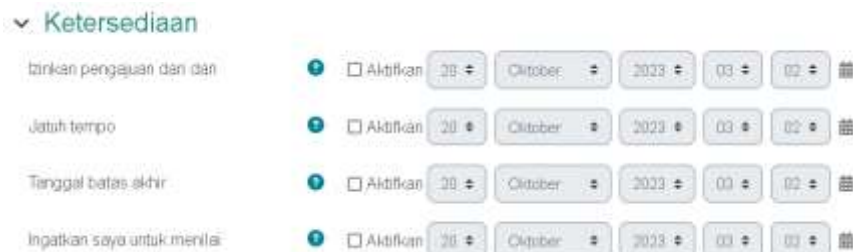
Figure 3. Task submission settings

After activating the feature, a notification will appear on the cellphone if a message is sent or entered. Next is the task upload feature. This feature may not be active if the submission permission in the assignment section is activated. Actually this feature is very well used to limit the time of sending assignments. However, if the time on the lecturer's device and the time on the student's device are different, this could be a problem. Especially if the time zone setting on the moodle device which by default is the United States has not been changed, it is likely to cause problems. To prevent this, this feature should not be enabled.